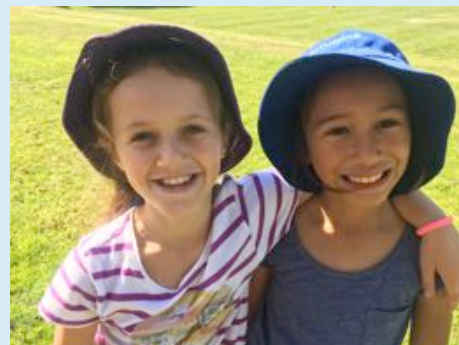
Thanks to our Sponsors...